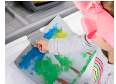
Design and colors may vary