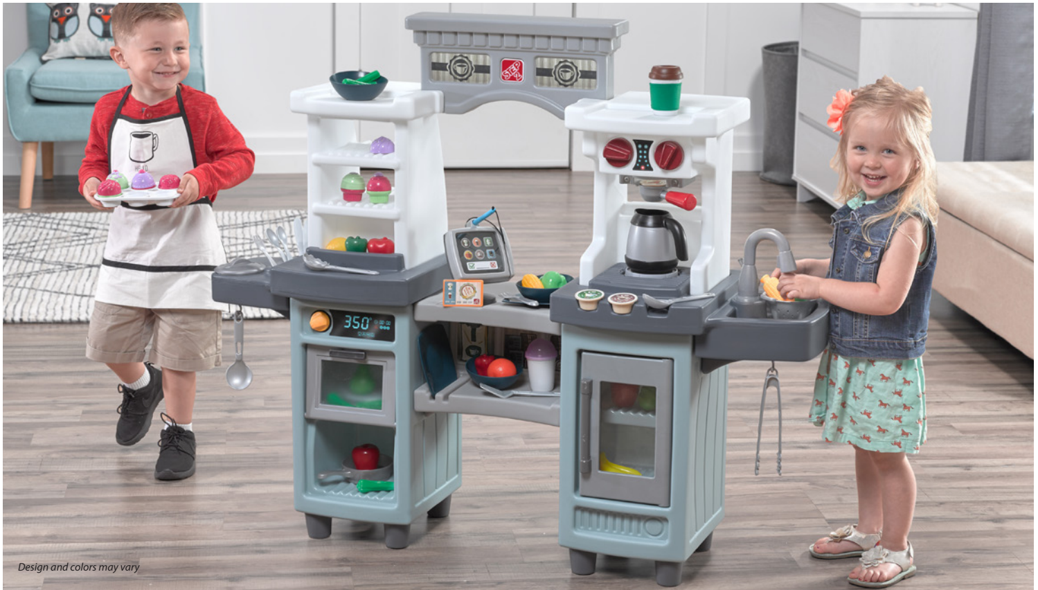
Design and colors may vary