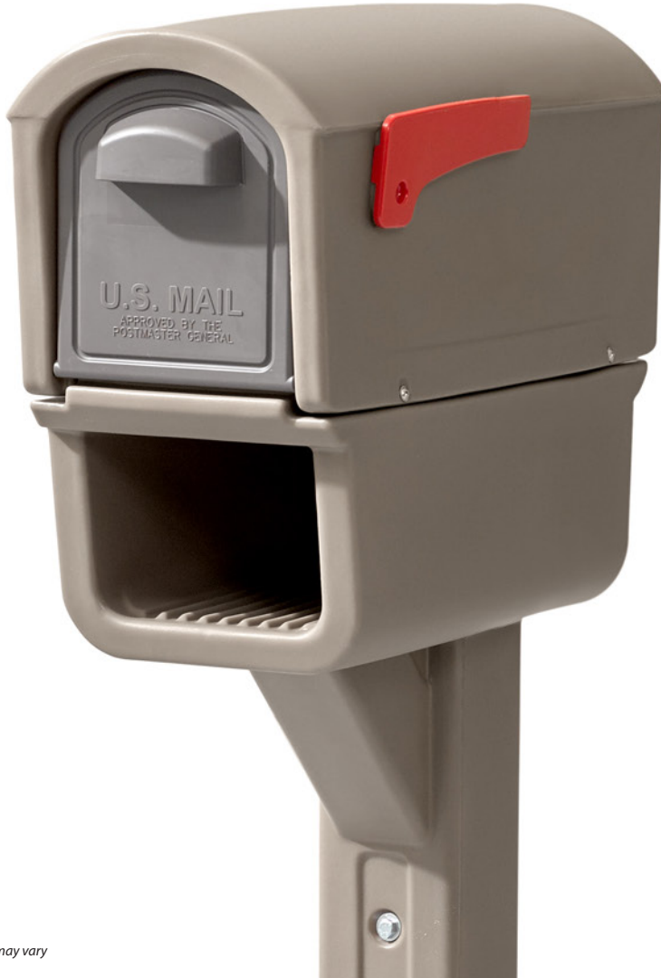
Design and color may vary