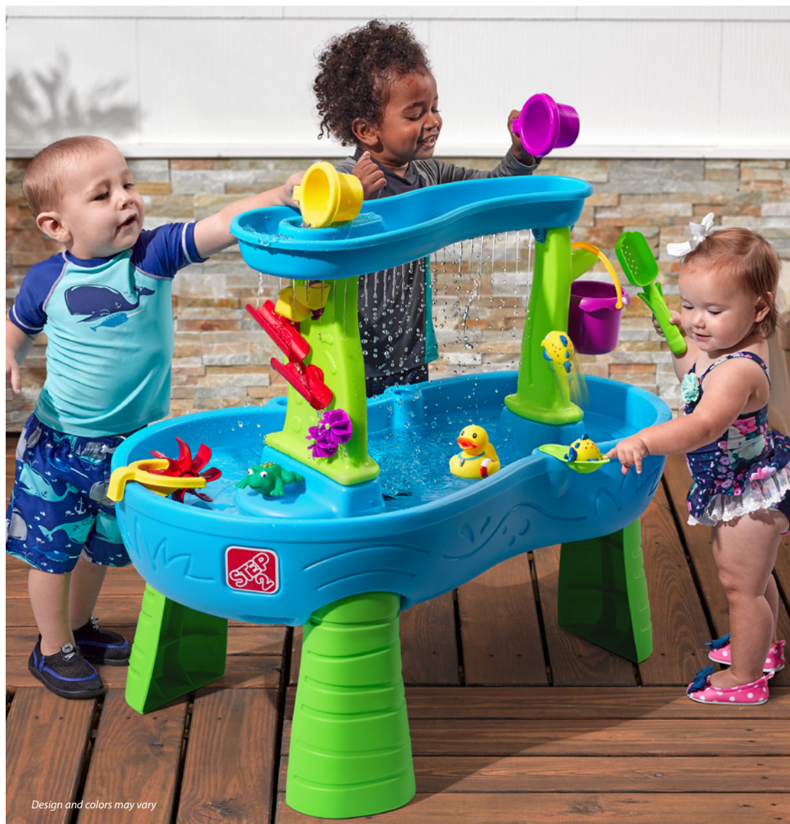
Design and colors may vary