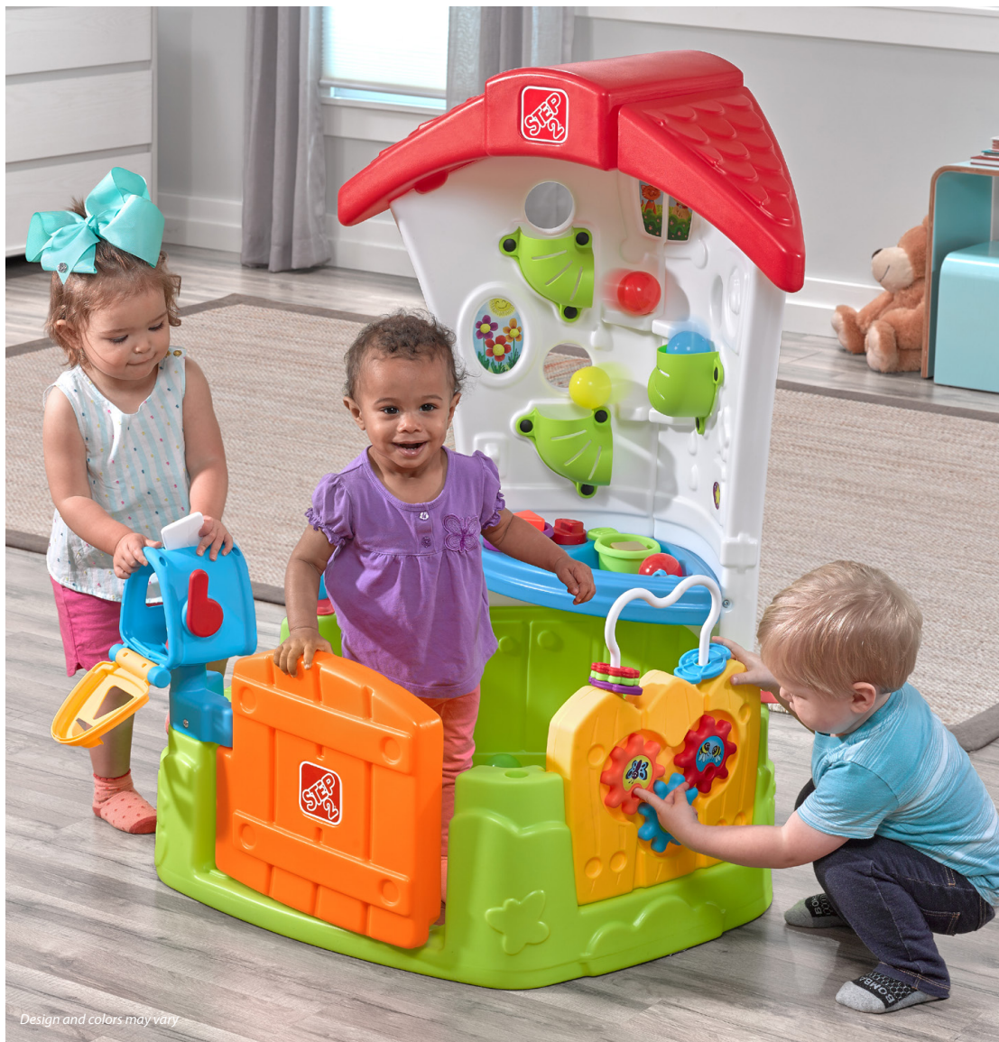
Design and colors may vary